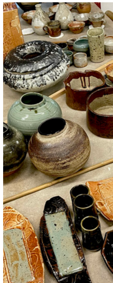
Colours from our latest gas firing