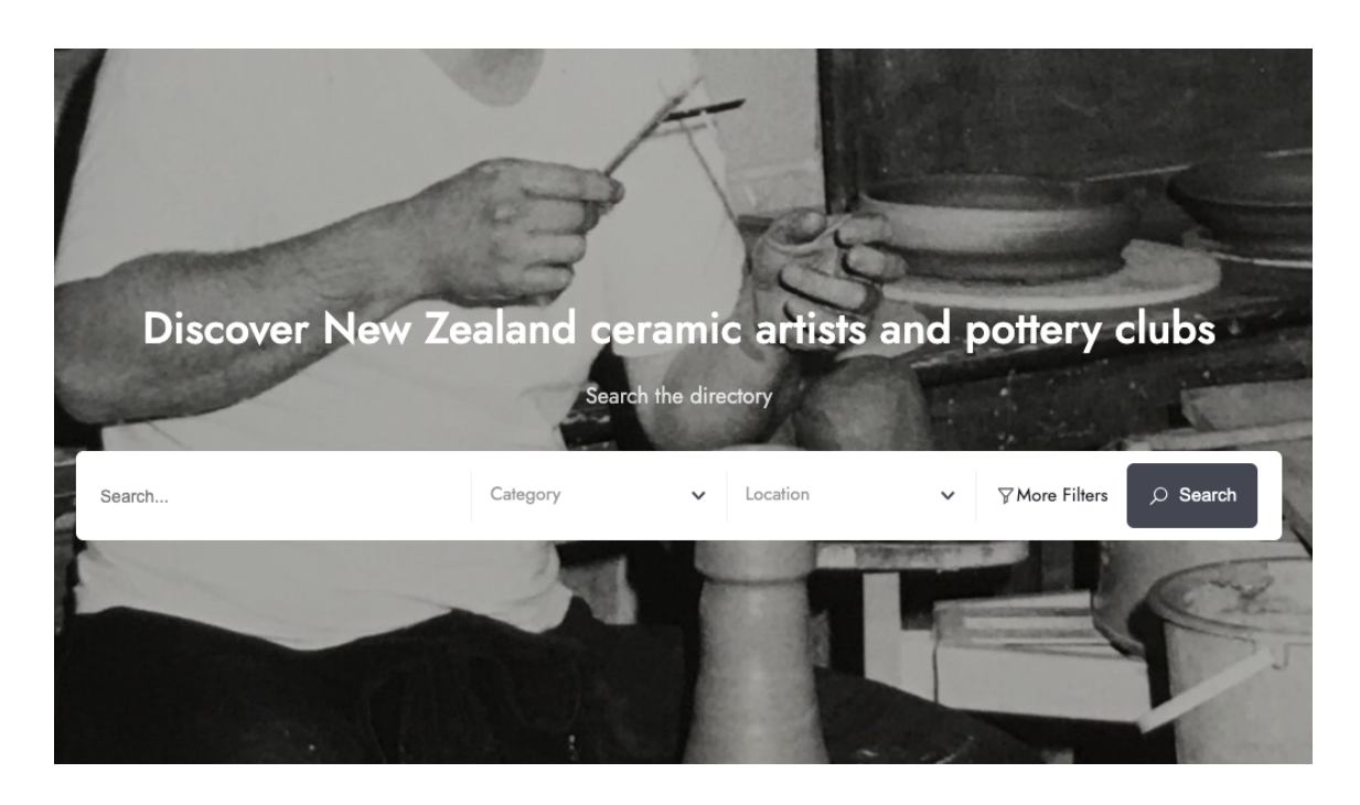
Visit the Directory