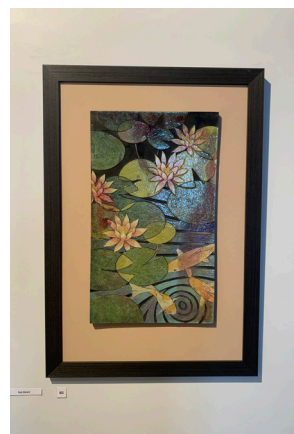
People choice award